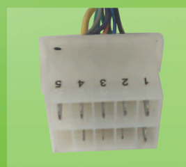
Factory Harness Connector