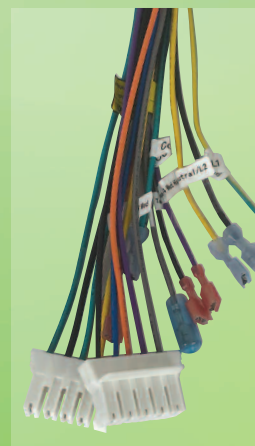
Direct Connect Harness