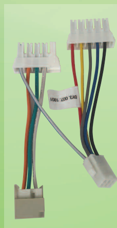
Ensite ® Adapter