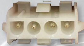
4 Pin Variable Speed