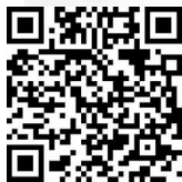
Programming the Azure Watt Motor